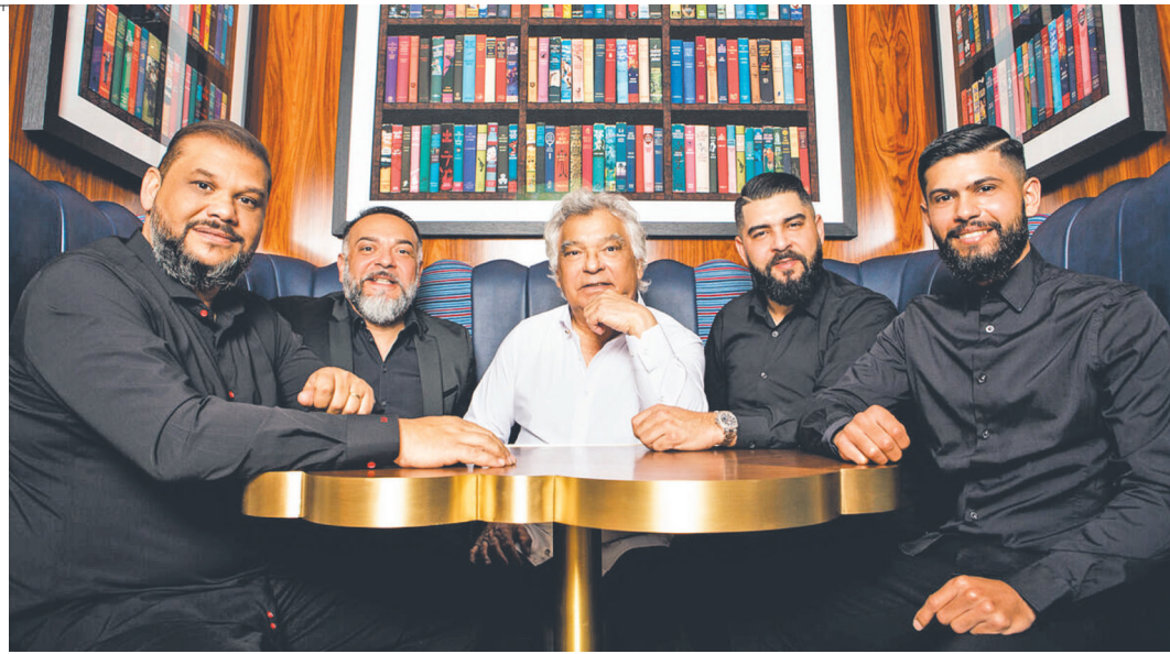
The Gipsy Kings, a Grammy award-winning French band, will headline a Latin and Mediterranean music showcase at 7 p.m. on Monday at The Sharon L. Morse Performing Arts Center. They will perform music from their ninth studio album, "Savor Flamenco."