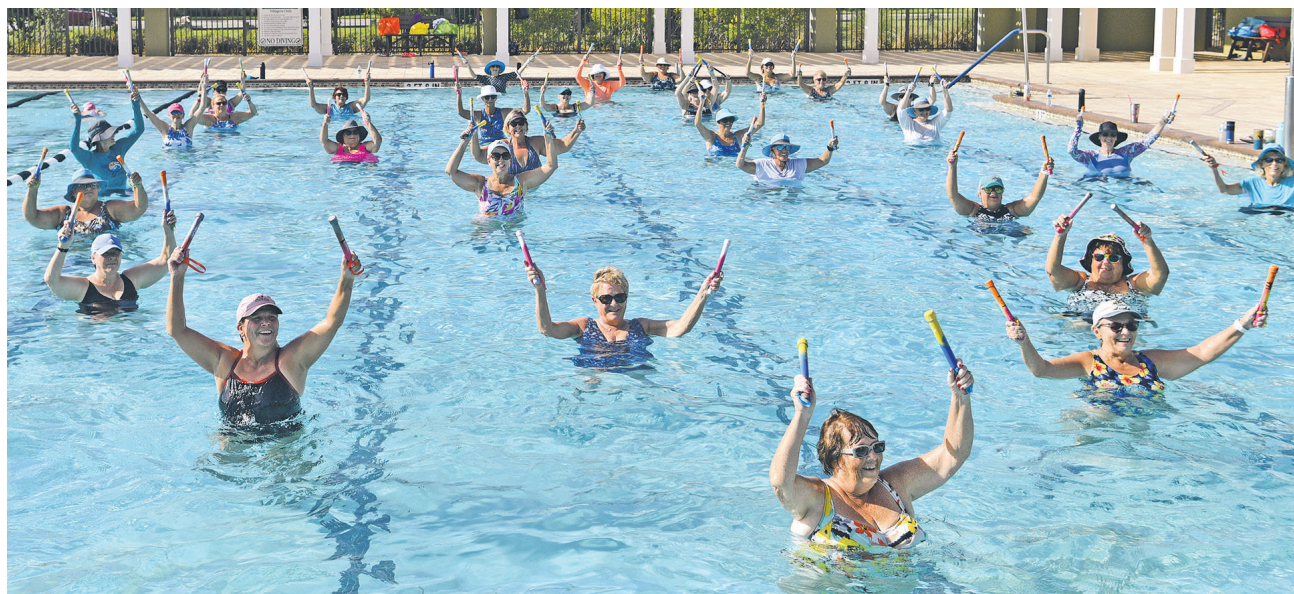
Above: Residents participate in an Aqua Drums Vibes class at Everglades Recreation.